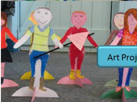
Art Projects – 3D Streetscape